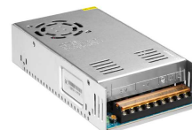
ALT350.24 Alim. in tensione IP20, 24Vdc, 350W