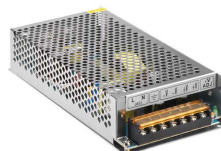
ALT250.24 Alim. in tensione IP20, 24Vdc, 250W