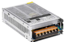
ALT100.24 Alim. in tensione IP20, 24Vdc, 100W