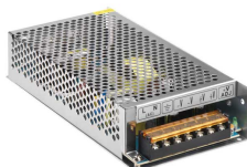
ALT150.24 Alim. in tensione IP20, 24Vdc, 150W