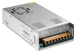
ALT500.24 Alim. in tensione IP20, 24Vdc, 500W